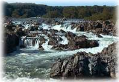
Great Falls Park