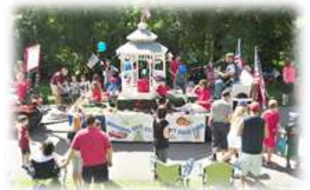
Annual 4 th of July festival