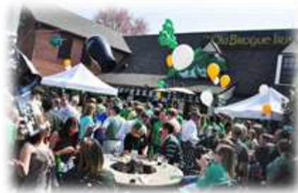
Annual Irish festival at Local Restaurant