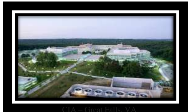
CIA - Great Falls, VA