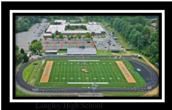
Langley High School

Live in your own version of "The White House". This lovely four bedroom with 3 bathrooms home sits on a park-like setting. With almost one acre of land this sparkling updated home has a beautiful kitchen w/wonderful eating space, imported crystal chandeliers, gorgeous hardwood floors, built-in bookcases, custom amenities, large 2-car garage, beautiful grecian pool w/custom tile work. This home has a newly renovated kitchen, freshly painted and new roof. Rare opportunity to rent impeccable property on .93-landscaped acre corner lot.