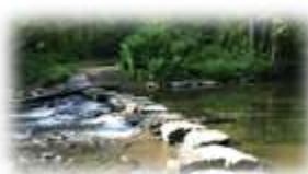
Miles of beautiful trails