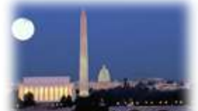
15 minutes from Washington DC