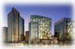
10 minutes from Tysons Corner